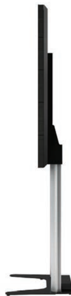
ScreenLifter invented and designed by:

At full HD resolution and a pixel pitch of 1.5mm the Leyard TVF1.5 LED Video Wall mounted in the ScreenLifter reaches a screen diagonal of 135in. This compact product comes in a flight case and is ready to use without losing any time with assembly and requires less man power to reach superior visual performance and value to customers due to excellent gamma grayscale.