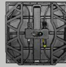
Rental Cabinet Frames

Leyard CarbonLight LED displays offer accessories to enhance and complete modular LED video wall systems for rental and staging applications.